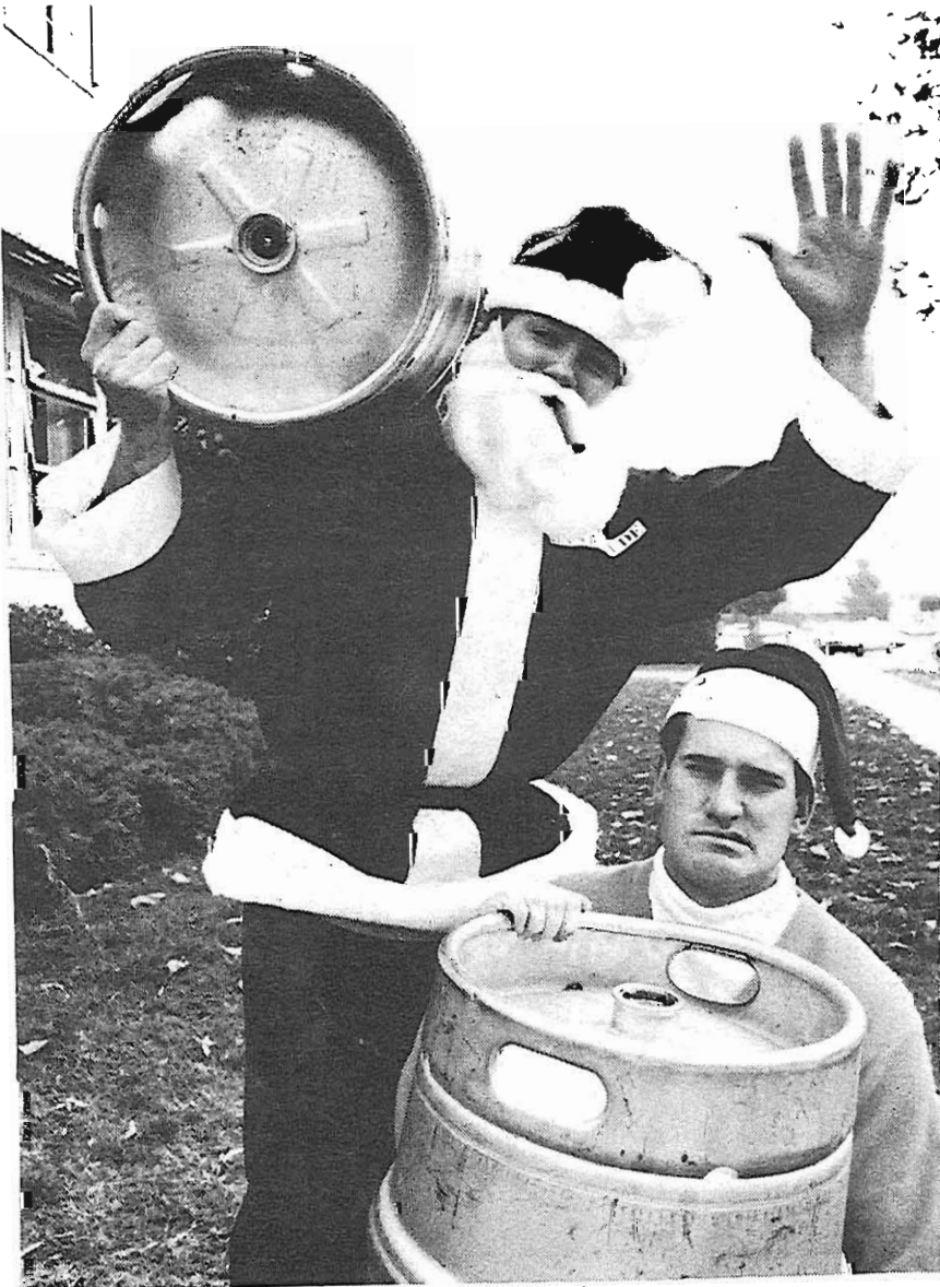
At least someone knows how to party.

Hey guys, you won't be needing these for rush, but I'm throwing a bash down at the South Pole, so drop on over...by the way, sororities are invited! Happy Holidays!