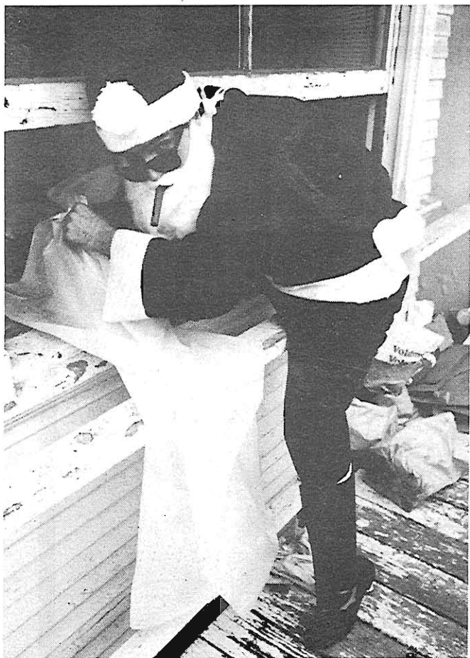
Santa Dude "visits" an unsuspecting host.