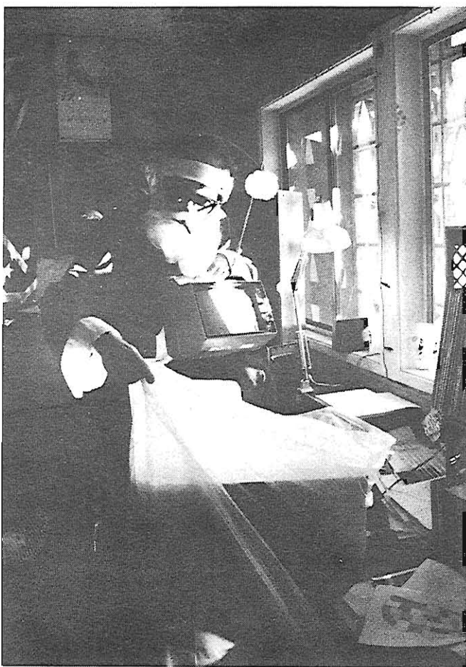
Santa Dude removes "old" stereos, TVs, watches, and silverware probably not wanted by the original owner.