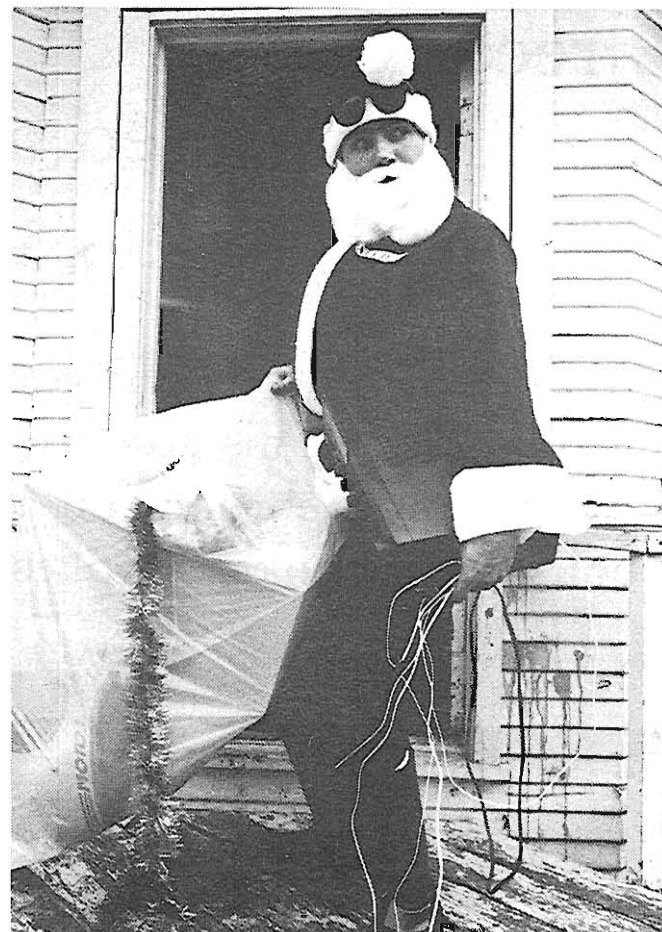
His bag full of "garbage," Santa Dude helps the neighborhood by cleaning out apartments.